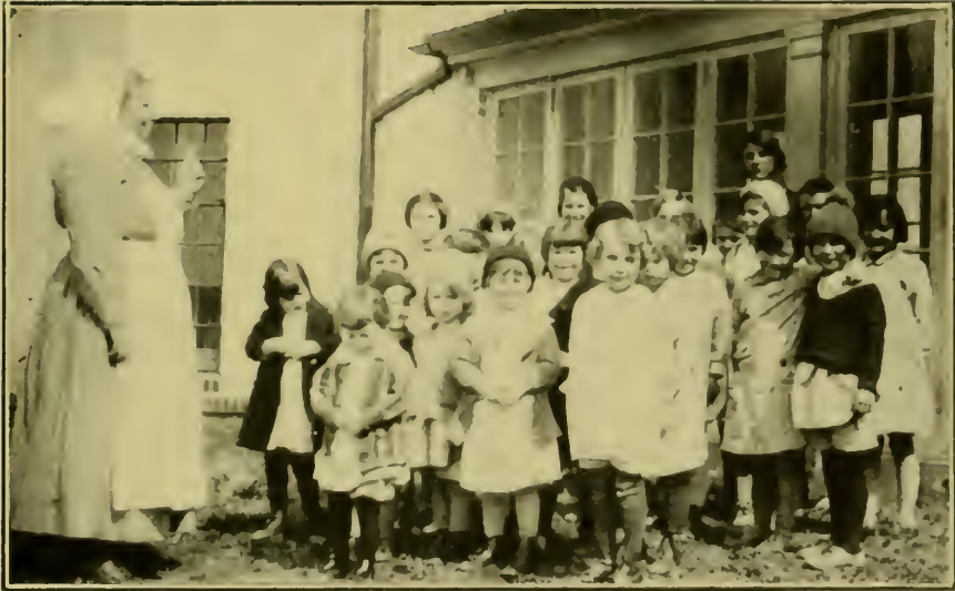
Looking for the Easter Bunny